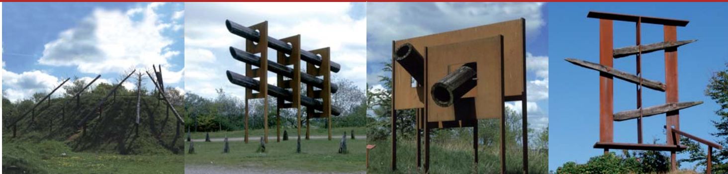
6. Saturn's Hair