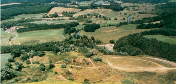
The landscape of Tørskind Gravel Pit